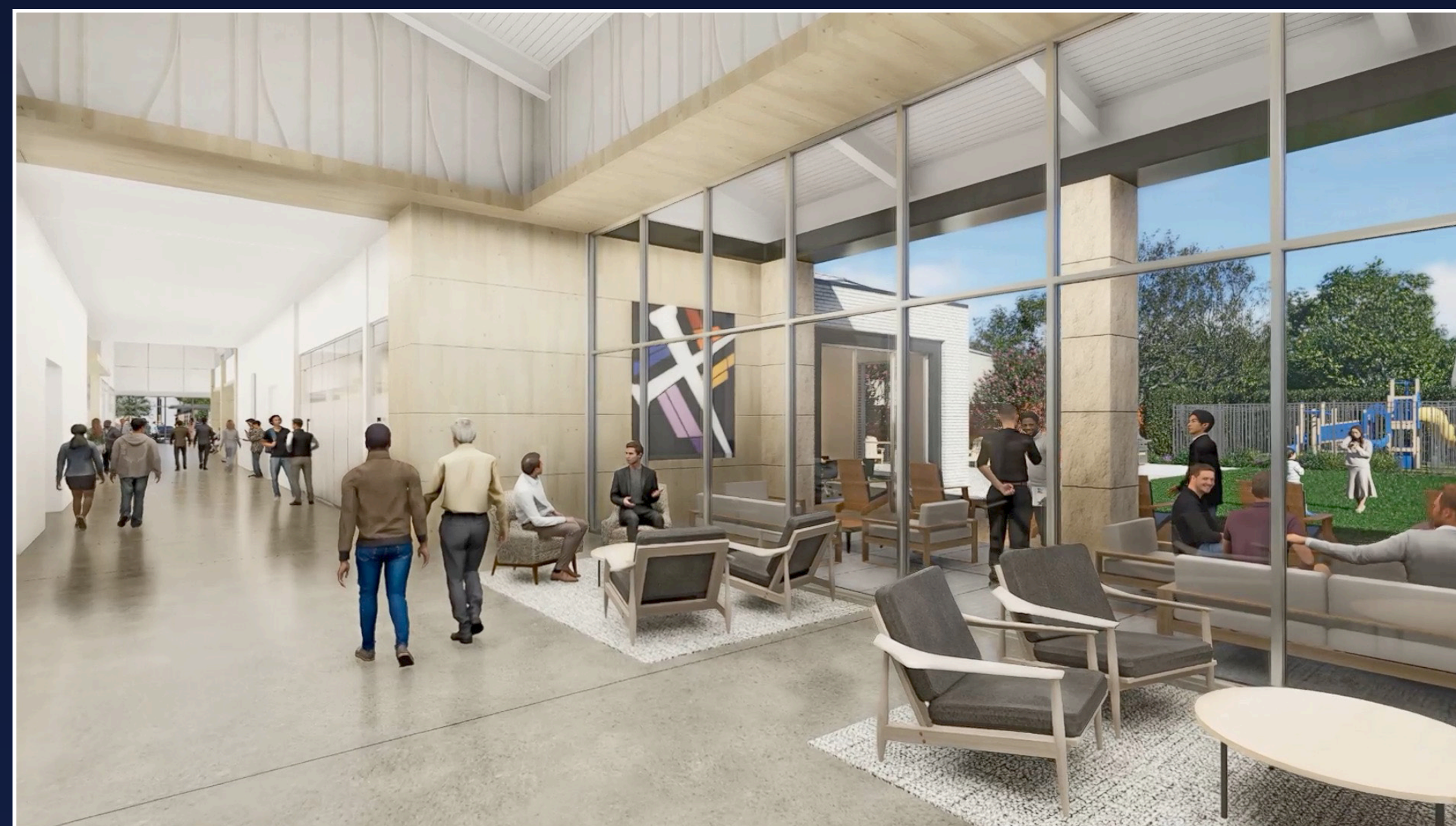
WELCOME AREA & CORRIDOR TO SANCTUARY