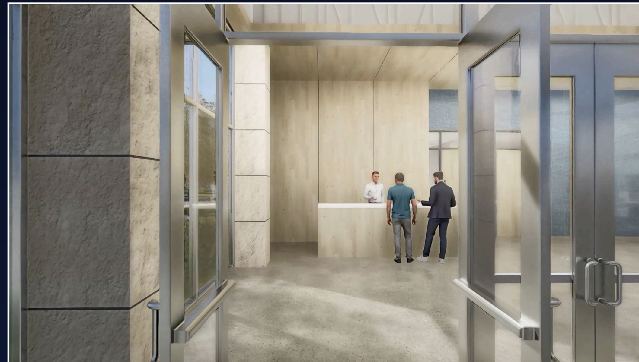
NEW EAST ENTRY DOORS & WELCOME DESK