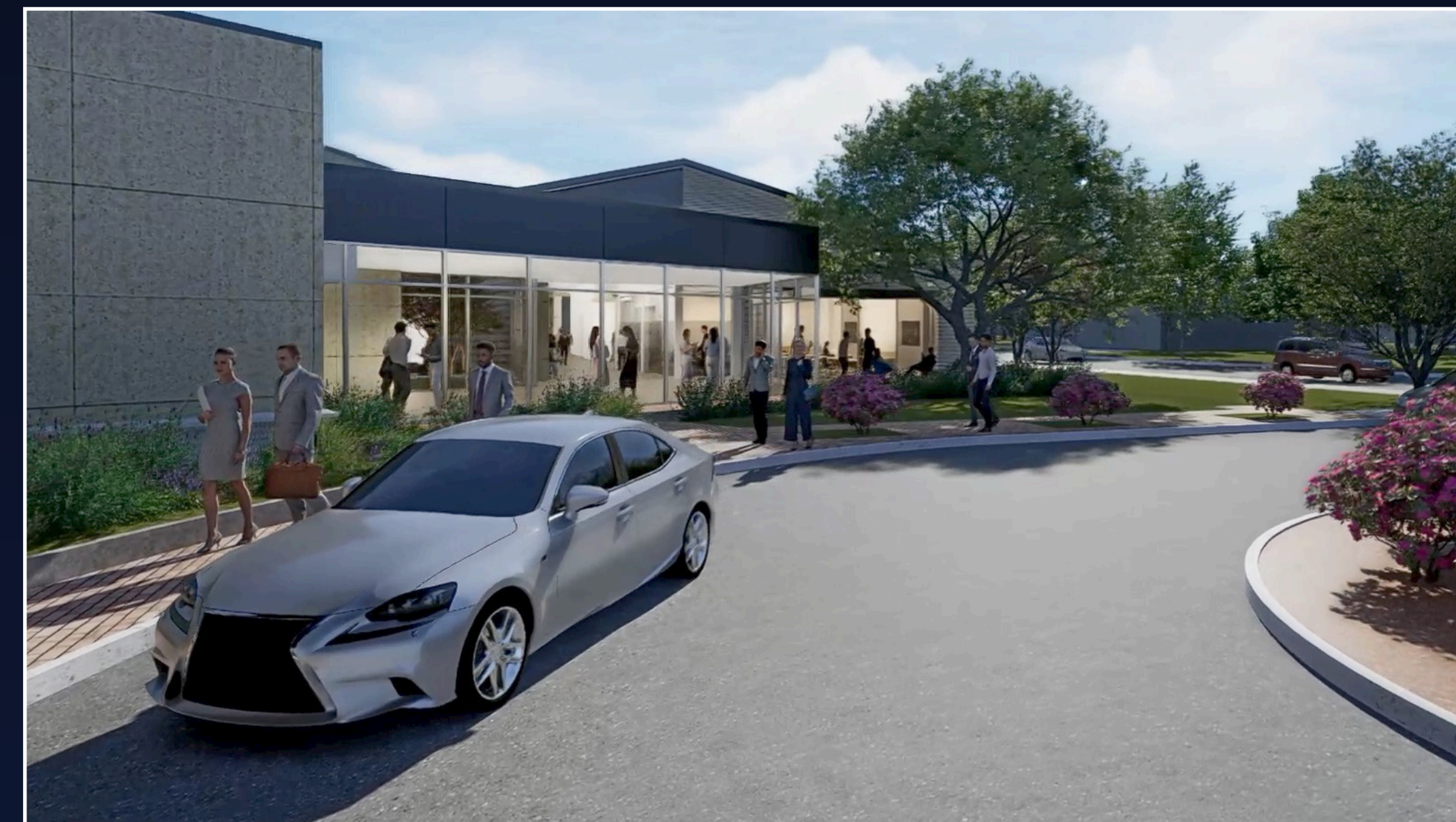
VIEW FROM CIRCLE DRIVE TO NEW CORRIDOR