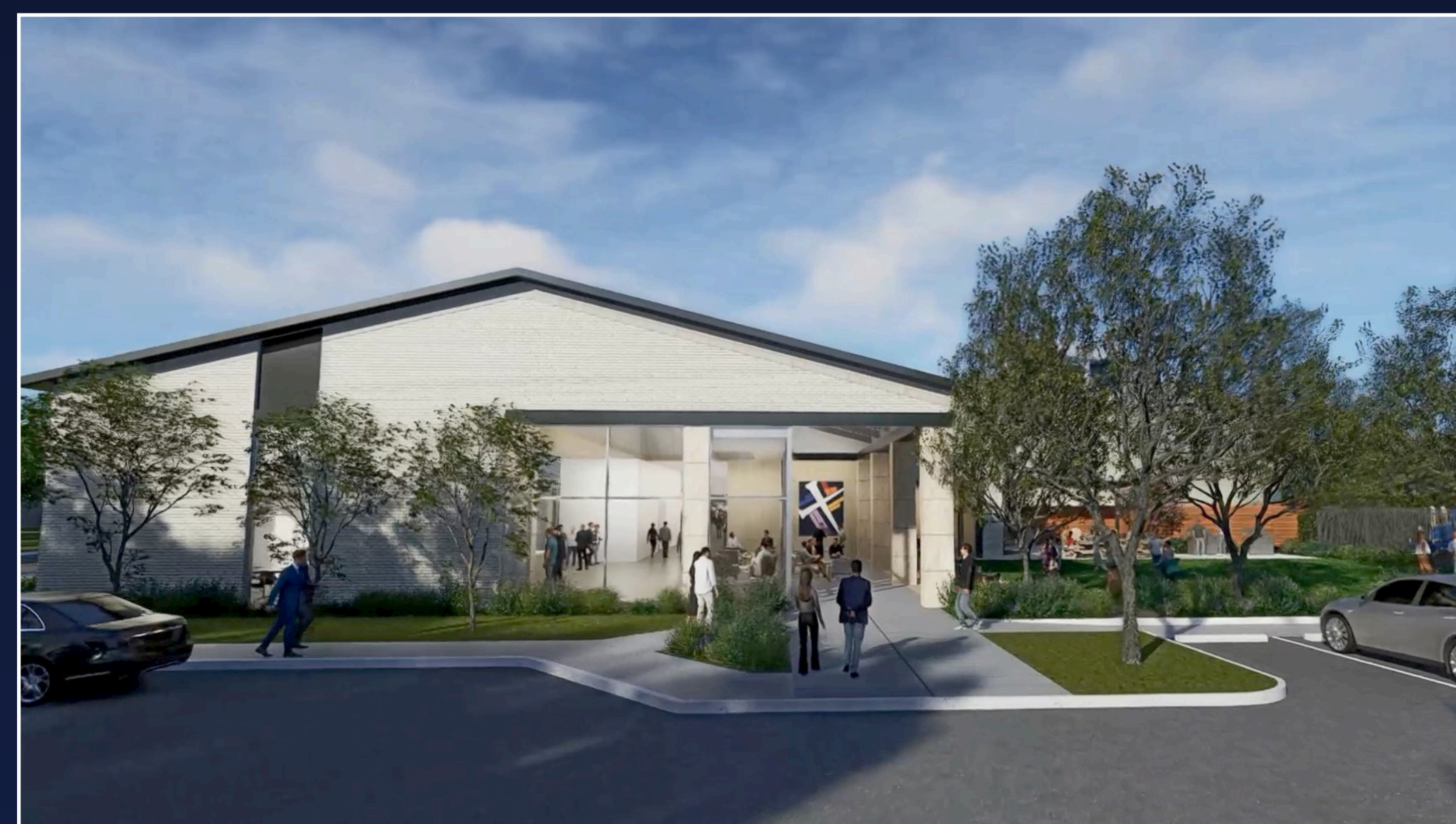
EAST ENTRY WALKUP & OUTDOOR SPACE