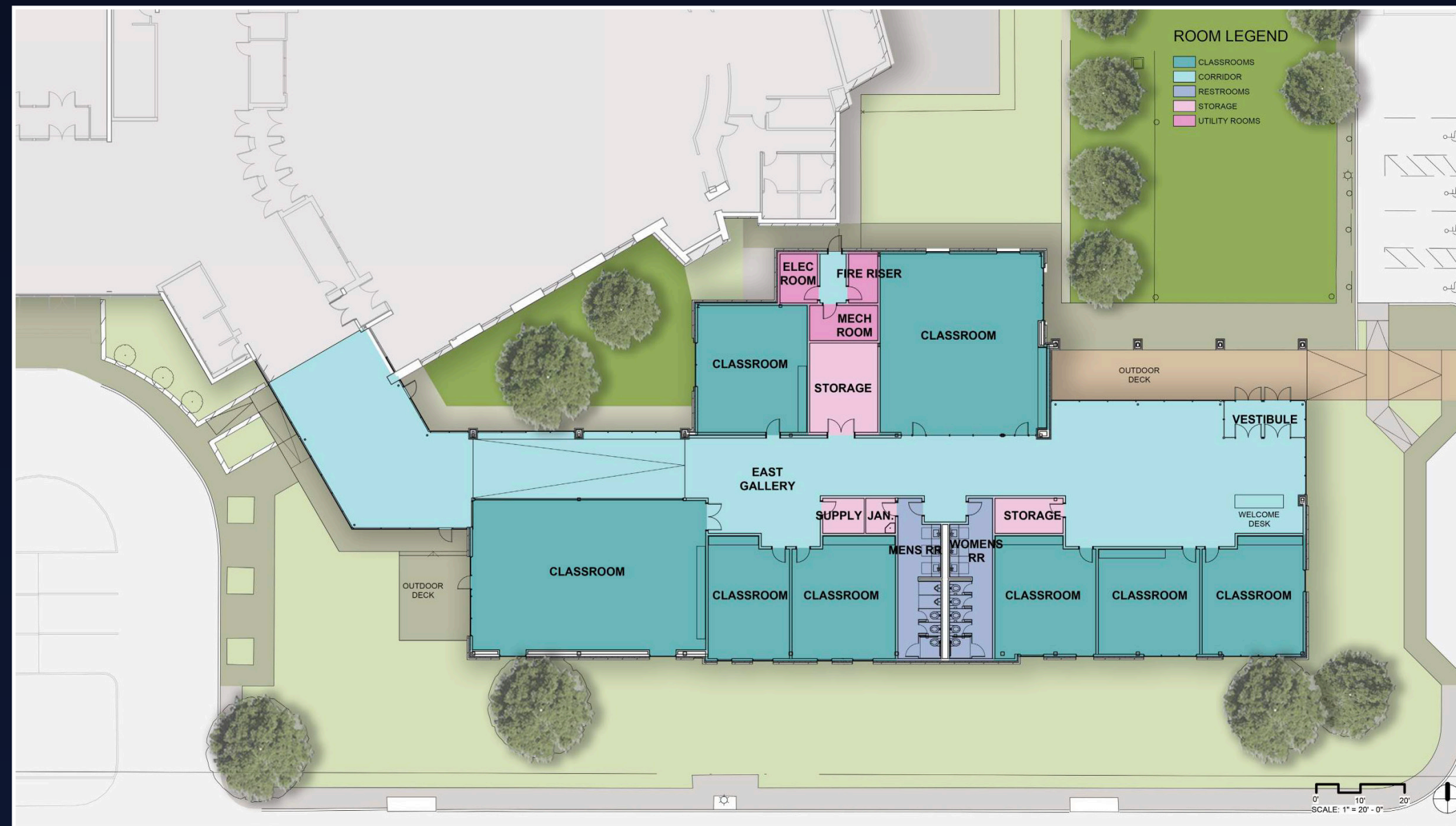
FLOORPLAN VIEW - PHASE I MORE CLASSROOMS & FACILITIES