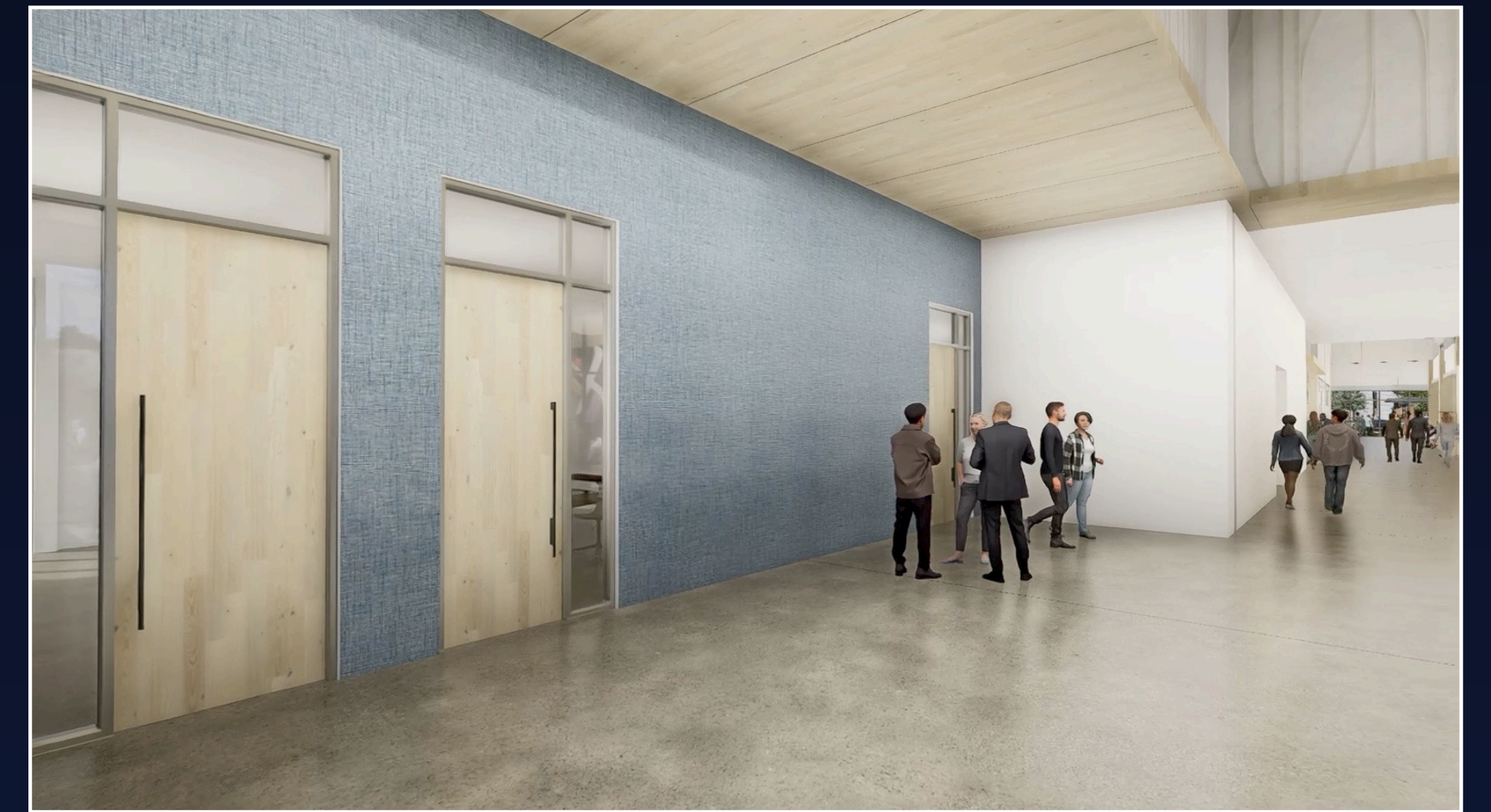
CLASSROOMS AT NEW EAST ENTRY