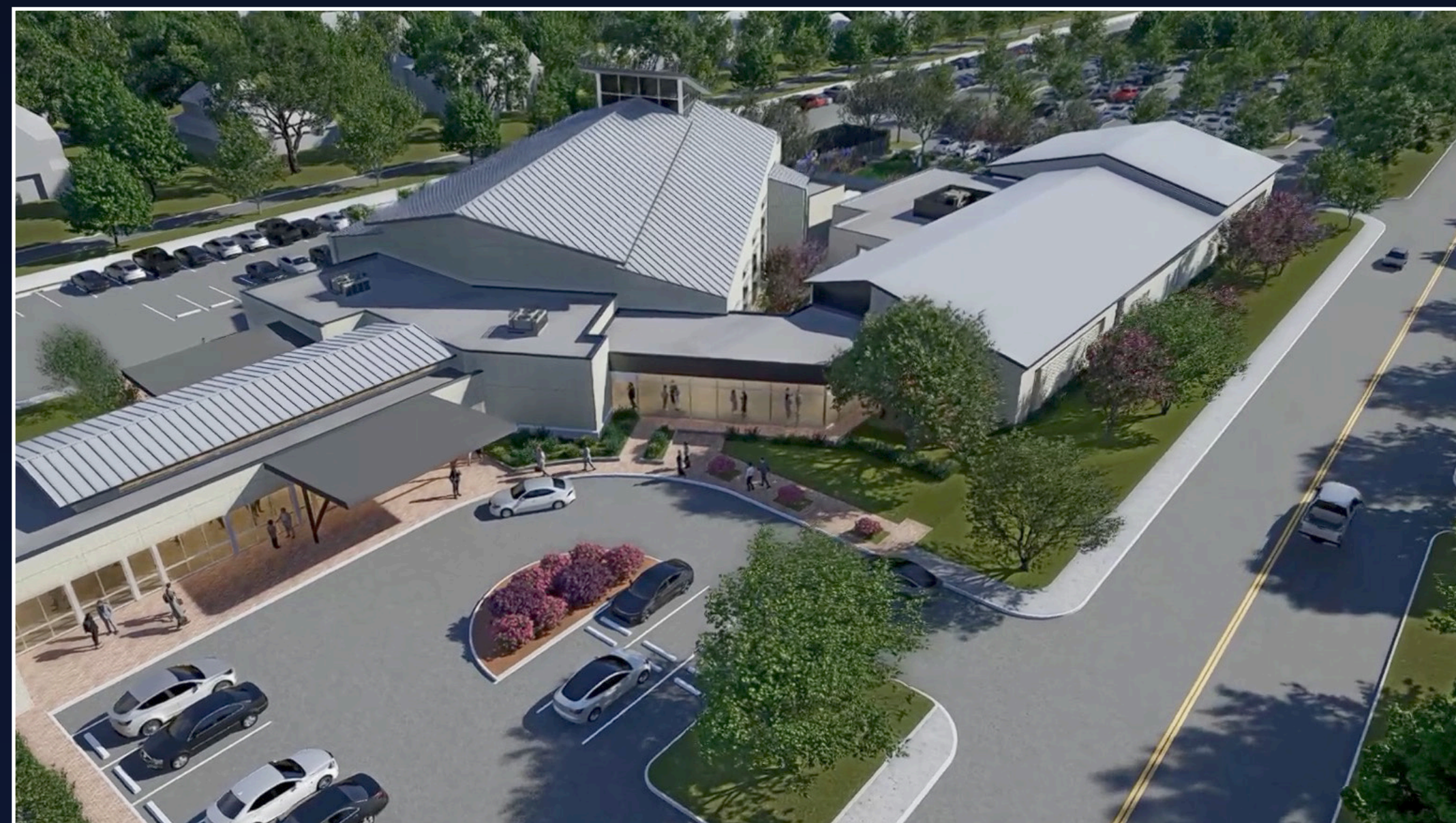
AERIAL VIEW FROM WEST/CIRCLE DRIVE