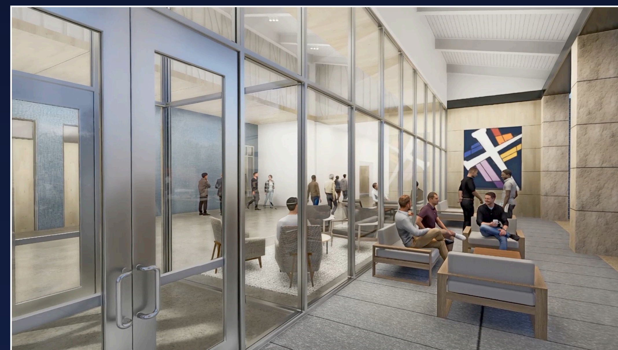
COVERED EAST ENTRY WITH PATIO SEATING