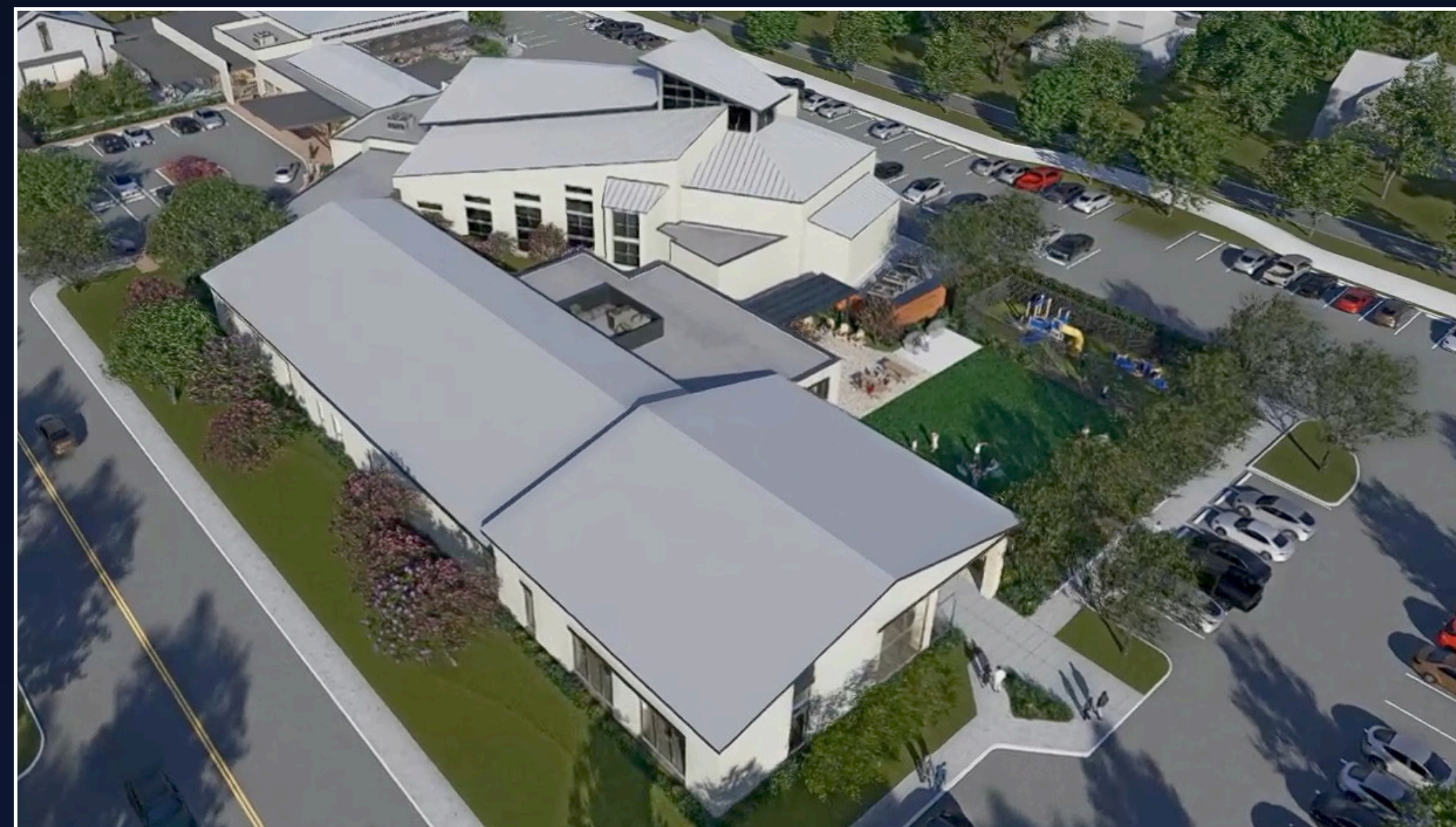
AERIAL VIEW FROM EAST/PARKING LOT