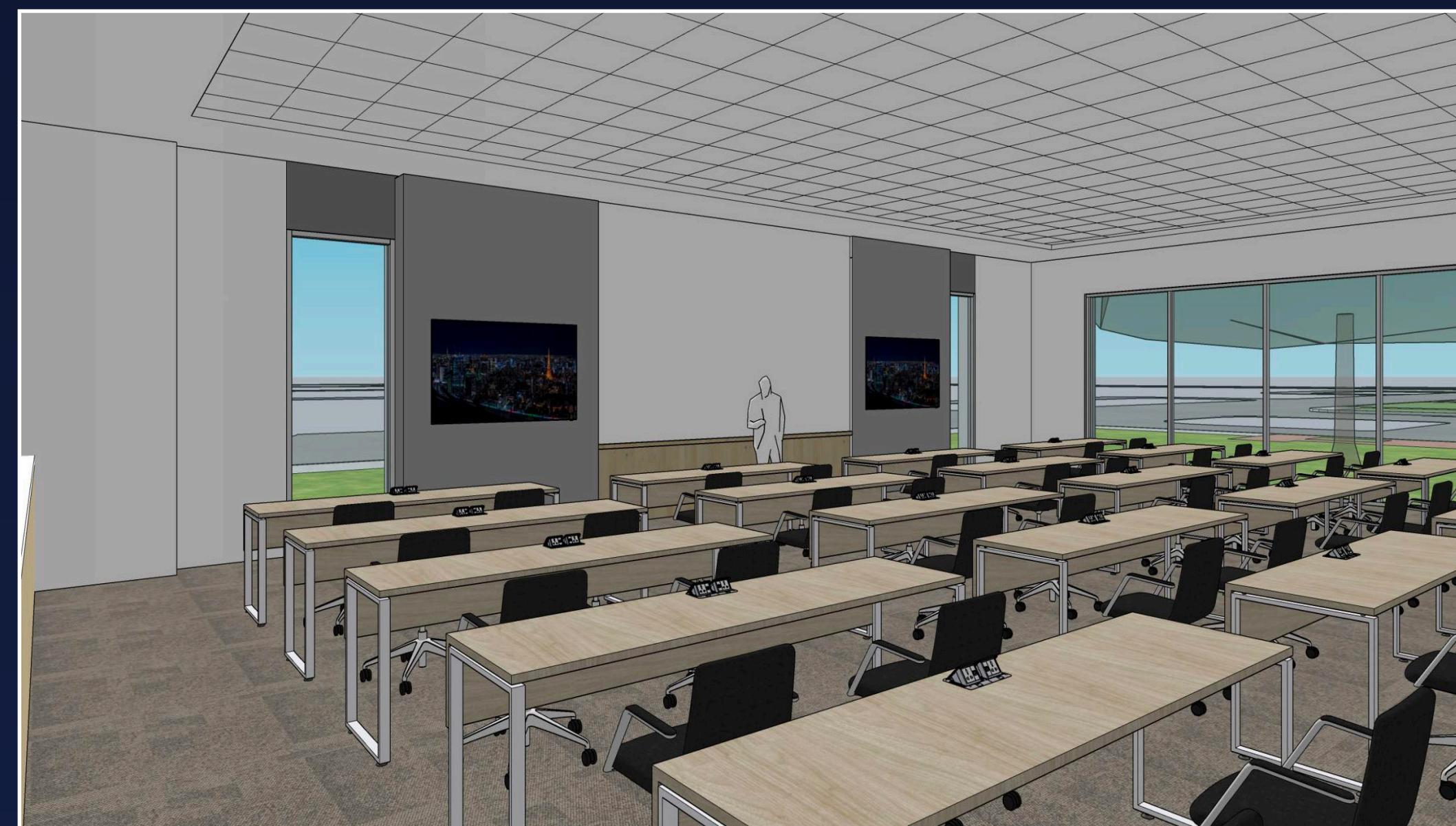
MODERN ADULT BIBLE CLASSROOMS