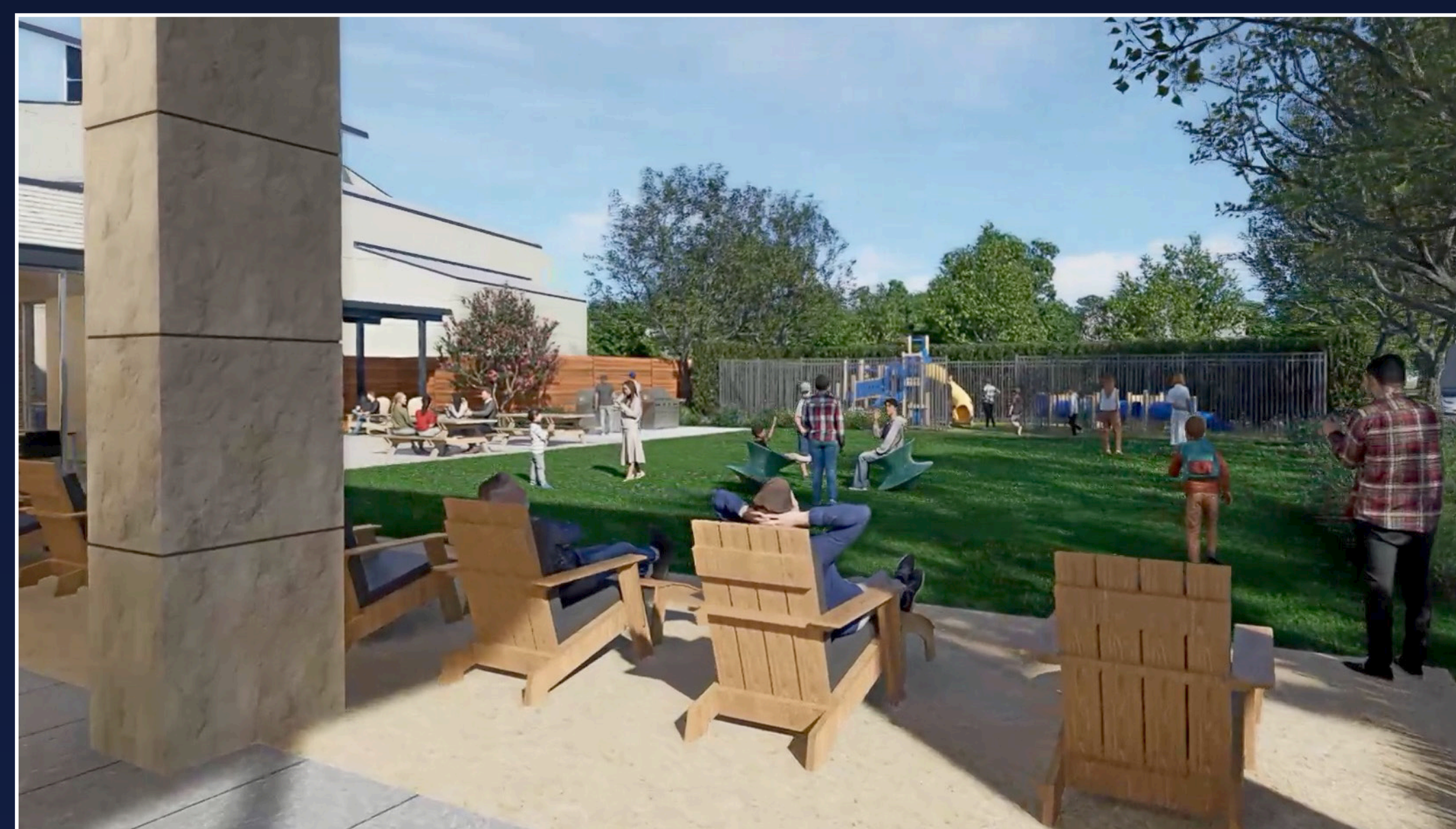
OUTDOOR GATHERING AREA FOR ALL GENERATIONS