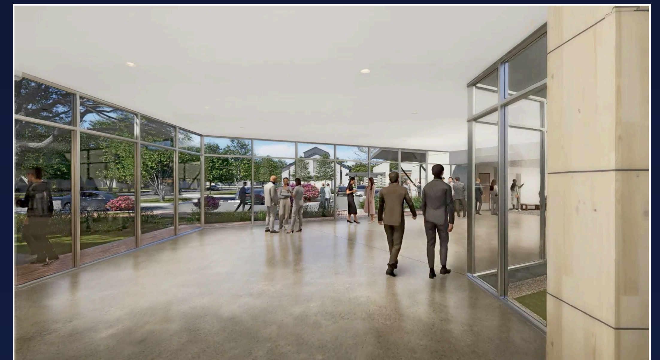
WINDOWED CORRIDOR CONNECTING THE NEW BUILDING TO THE EXISTING SANCTUARY LOBBY